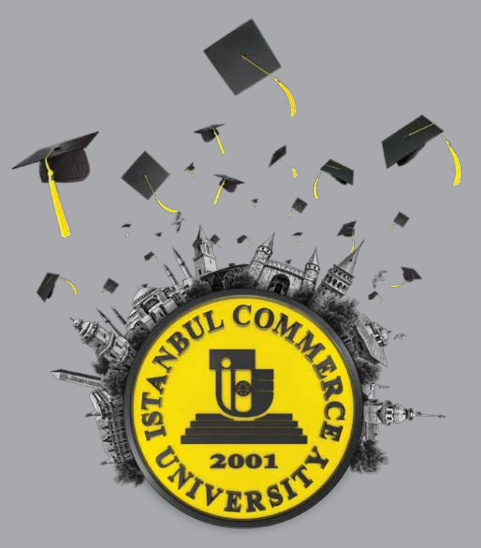
Teaching with mind & educating with heart