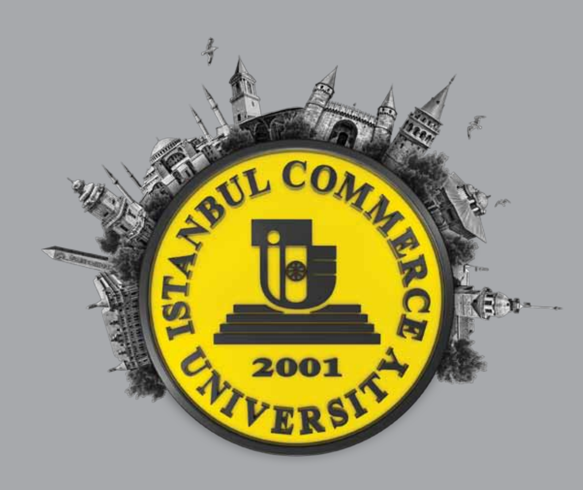
Teaching with mind & educating with heart